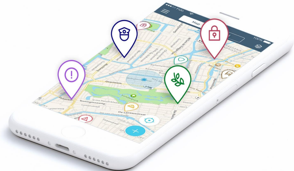
Mobile device showing map application