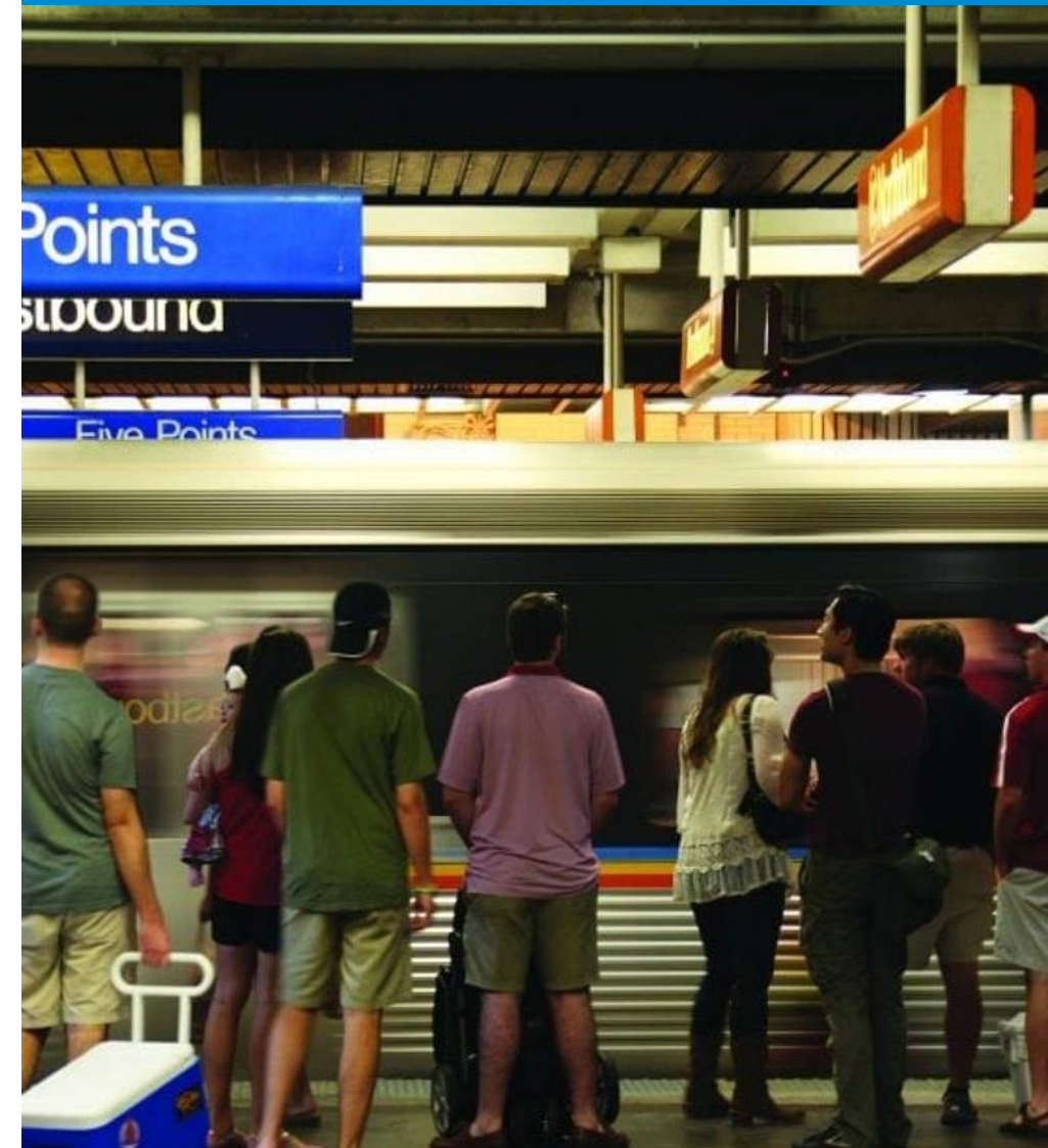
Riders on MARTA train Platform