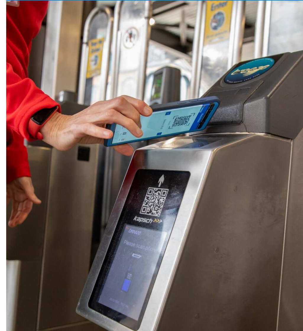
Rider using mobile device to enter faregate

*This Contract is being funded by local capital and local operating funds.