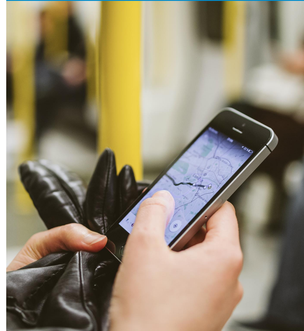
Rider using mobile device inside vehicle

The Office of Customer Technology requests approval by the MARTA Business Management Committee of the resolution Authorizing the GM/CEO or his delegate to enter into a Contract for Replacement of the MARTA On The Go Mobile Application , RFP P50565, with Reflexions Data, LLC in the amount of $6,344,652.